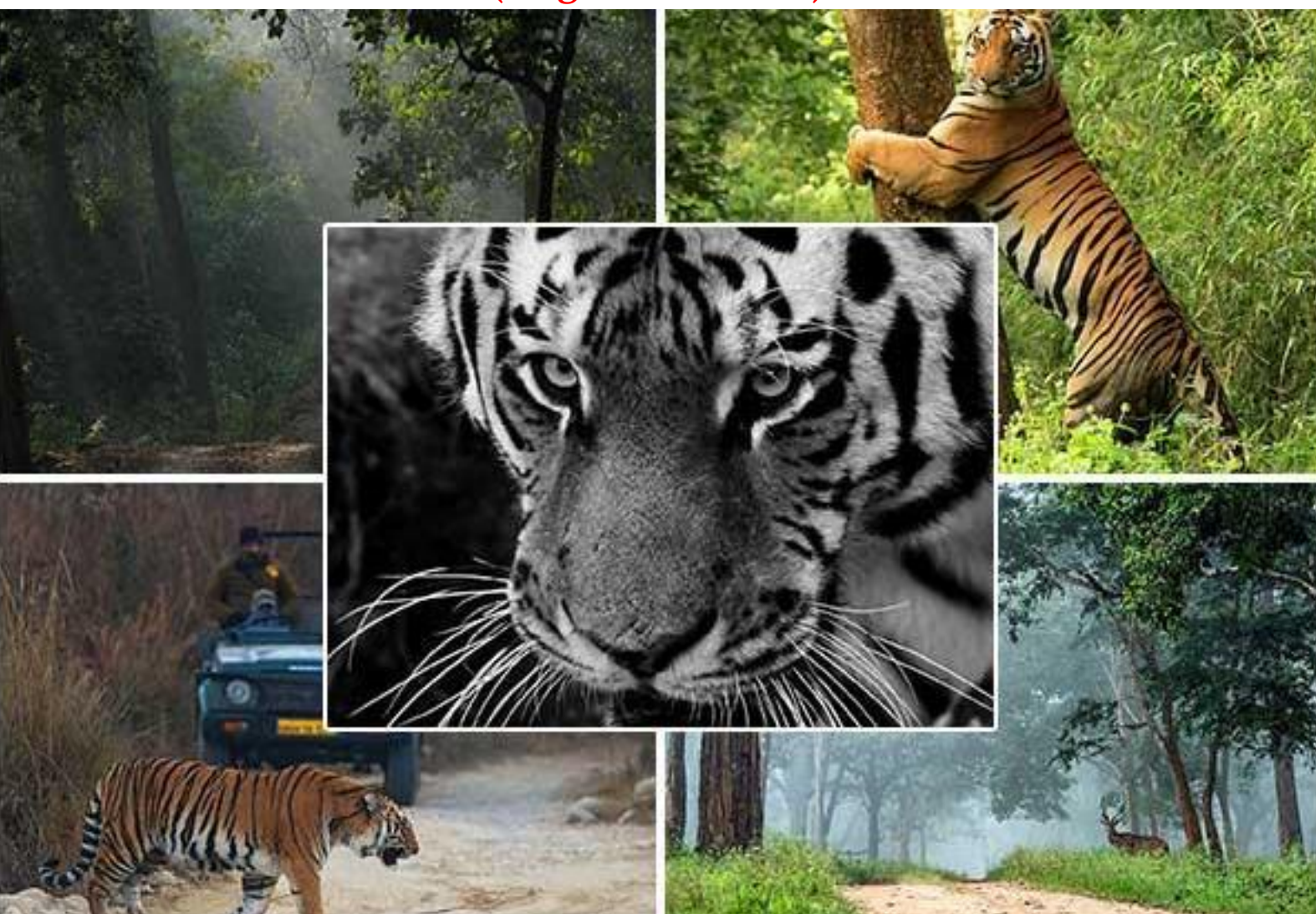
PAPER – III - General studies UNIT II: ENVIRONMENT, BIODIVERSITY AND DISASTER MANAGEMENT

Group - I Services (Main Examination) (Degree Standard)