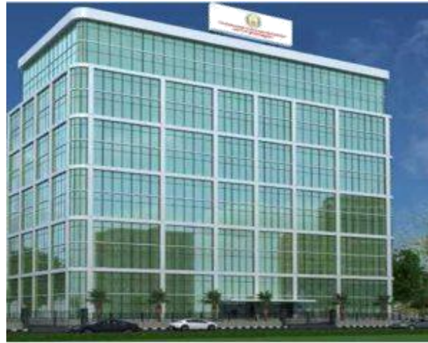
URBAN ADMINISTRATIVE BUILDING